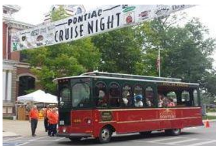
Jolly Trolley Tours